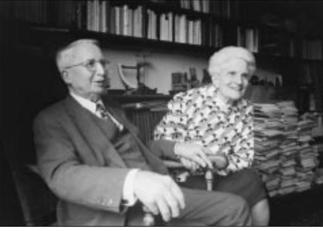
Cartan at his desk (above) and with Madame Cartan, 1996.

on today in Kosovo. You hear people say, "Ah, Europe must have a common foreign policy." Those are empty words: how can this ever be achieved without an authority that can make decisions and implement them and that can also be under democratic control? Nothing can ever be achieved unless a European constitution gives birth to a federal authority and makes it fully responsible for clearly defined areas of common interest. Of course, this federal authority would in no way encroach on the respective spheres of responsibility of either the states, regions, or townships.